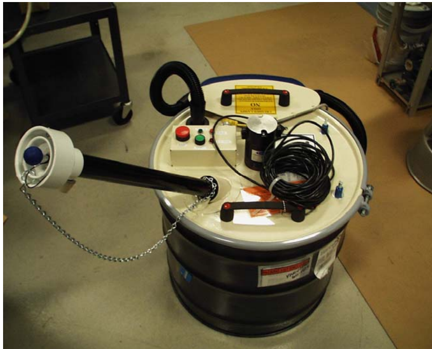
Figure 1. The Bulb Eater™ Model 55-VRS

Air Cycle Corporation made many mechanical integrity improvements during the latter half of 2002 to eliminate mercury emissions at potential leakage points (e.g. connections, fittings, attachments, etc.) as a result of mercury emission concerns by the U.S. Navy. Also newly developed for the system is the addition of a 10” storage drum for attaching the unit when not in use. The storage drum prevents phosphor and mercury particulate residue on the chain side of the unit from contaminating the storage area when not in use and when not mounted atop a 55-gallon waste drum. The 10” storage drum also saves space when the unit is stored. Air Cycle Corporation also improved the system further by including an air purge cycle that will run the vacuum pump for 7 to 10 seconds after the machine is turned off, a drum open sensor that cuts off the motor if the drum lid is opened, and a new control panel complete with indicator lights. The result of these efforts is the Bulb Eater™ Model VRS system. Figure 1 displays the Bulb Eater™ Model VRS system atop a 55-gallon crushed lamp waste drum.